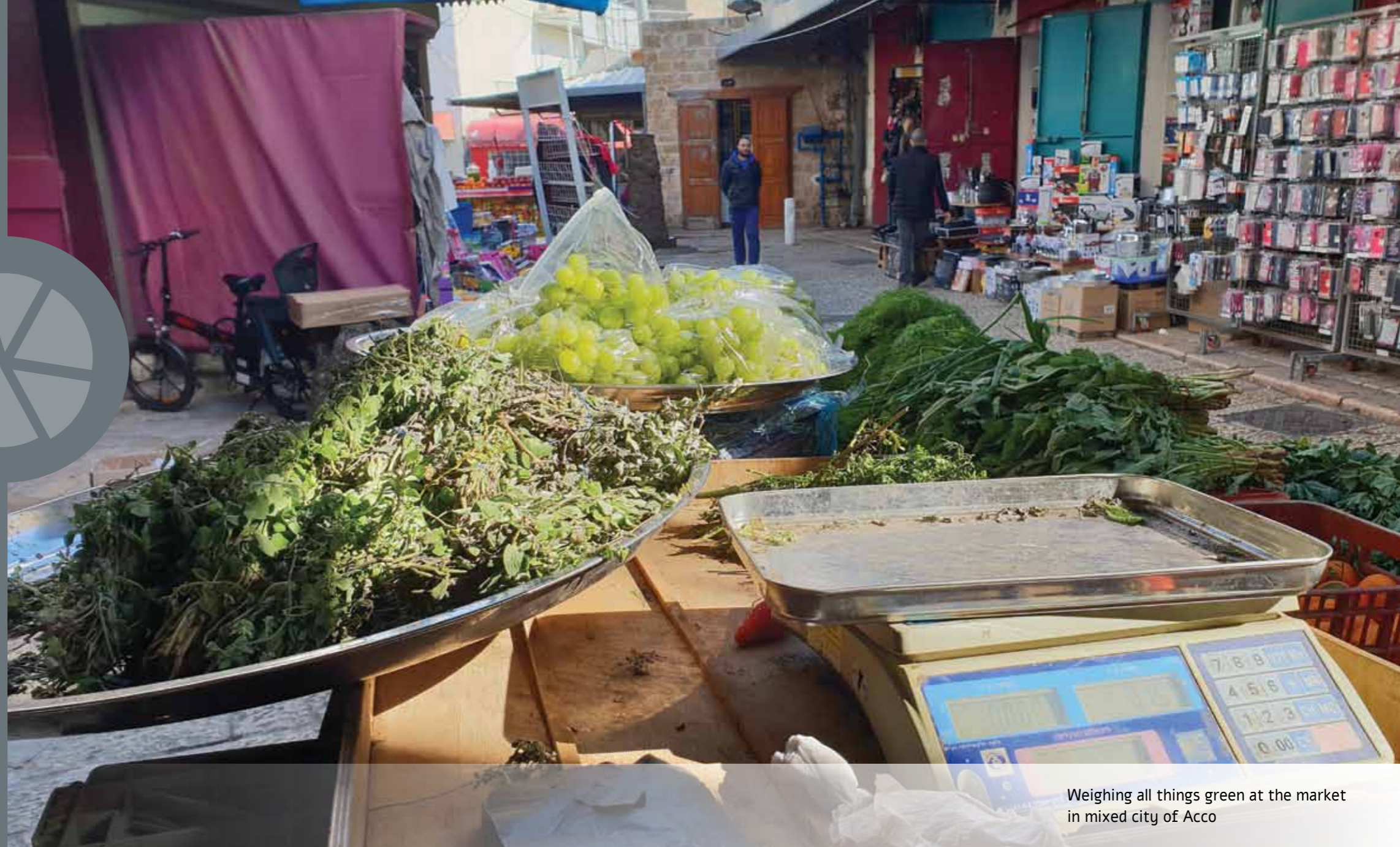
Weighing all things green at the market in mixed city of Acco